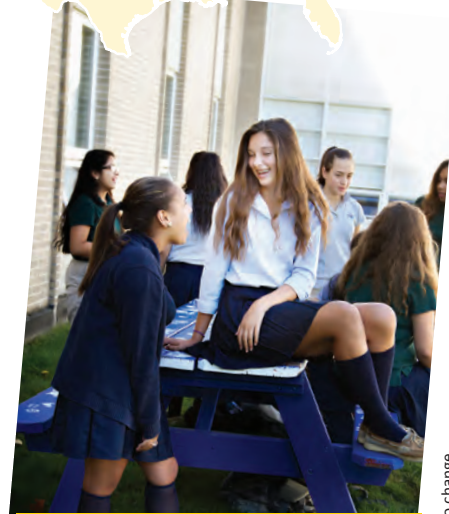
*All courses and options offered by the school are subject to change.