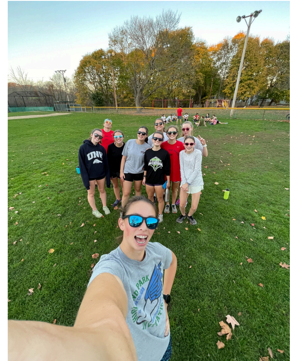
Friends & host family