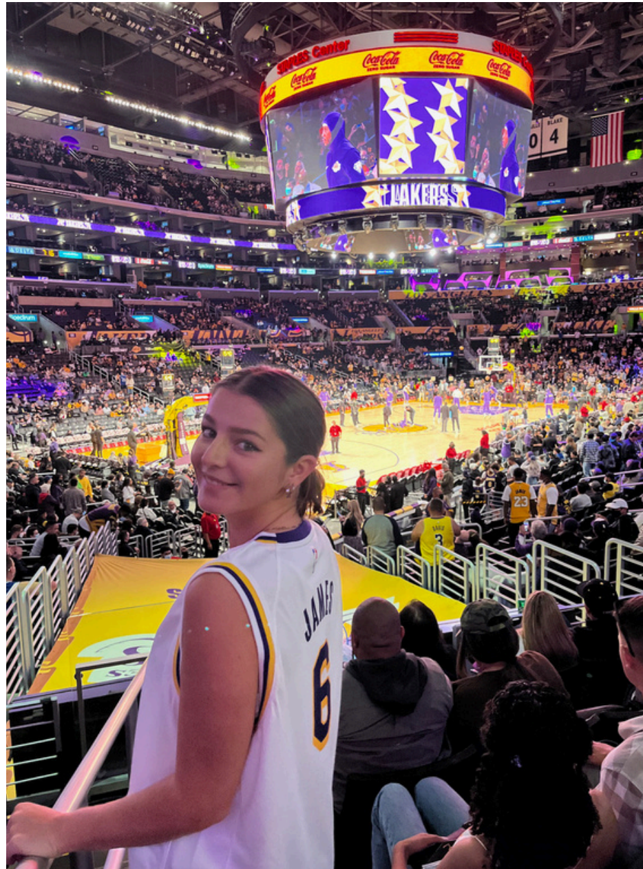
Sports, clubs, activities